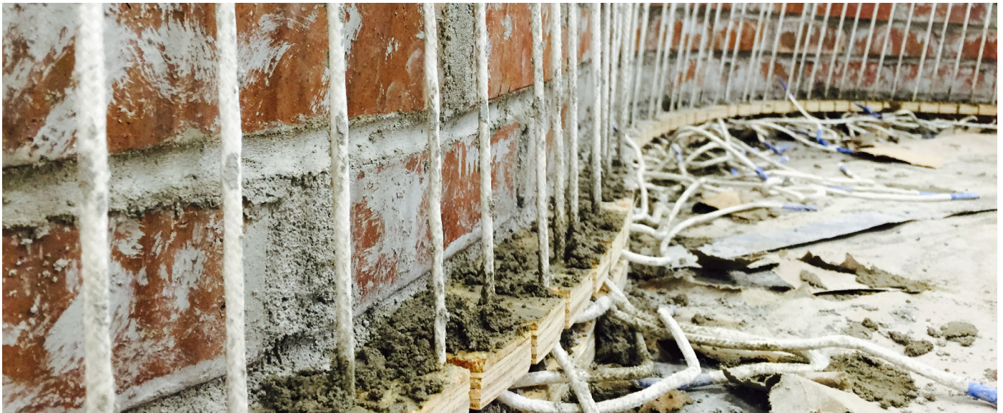
Figure 1: Bottom brick courses of Ruled Surface wall with string guides..

FEDERICO GARCIA LAMMERS South Dakota State University