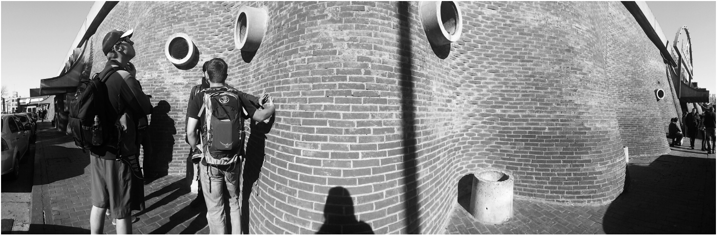
Figure 2: Montevideo Shopping Center Ruled Surface North Wall.