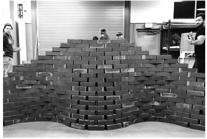
Figure 4: Improvisational Dry Stack Ruled Surface Brick Wall, 4'x12'x4'..

To build a brick and mortar Ruled Surface wall students designed a system of vertical string guides that established the geometry of the wall surface and limited improvisation; approximating matter into