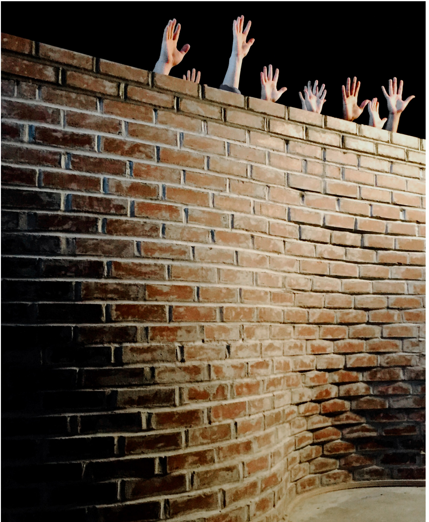
Figure 5: Ruled Surface Brick Wall, 7'x8'x4".